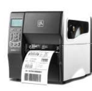
Zebra ZT230 Series Desktop Printer Print method: Direct Thermal print method Resolution: 203 dpi/8 dots per mm Optional: 300 dpi/12 dots per mm Memory: 128 MB Flash; 128 MB SDRAM Print Width: 4.09"/104 mm