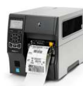
Zebra ZT420 Series RFID Printer Resolution: 203 dpi/8 dots per mm 300 dpi/12 dots per mm Memory: 256 MB SDRAM memory Max Print Width: 6.6"/168 mm Max Print Speed: 14 ips/356 mm per Second