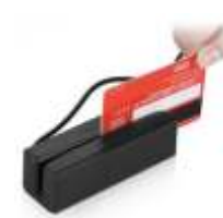
Pegasus 3 Tracks Mini Magnetic Card Reader & Encoder Three track magnetic card reader with serial output. This reader takes power from the serial port and outputs a 9600bps 8N1 ASCII serial stream. Interface PS/2, RS-232 or USB available 300,000 passes.