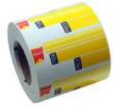
Shelf Tag Available all sizes and customized sizes with color printing and material thermal transfer, direct thermal and polyester.