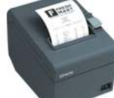
Epson TM-T20 Thermal Receipt Printer Epson's cost effective TM-T20 thermal receipt printer. Print Methods - Thermal line printing Print speed: Max. 150 mm/sec