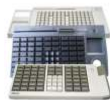
Pegasus KB-67/KB-78/KB-112 Programmable Keyboard With 66/78/112 Cherry MX keys based on gold crosspoint technology, and have tactile feeling. Different relegendable keycaps (1-fold, 2 fold, 4 fold) are available. 6 steps keylock, life cycles: >25,000, card swipe speed: 10 to 100 cm/s, KB-67 with smart card reader