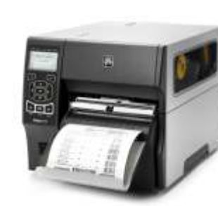
Zebra ZT400 Series Industrial Printer Print Methods - Thermal transfer and direct thermal printing Resolution: 203 dpi/8 dots per mm Zebra's Link-OS® environment