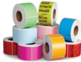
Color Thermal Labels Various sizes available thermal transfer & direct Thermal papers

Thermal Pos Receipt (Cash Register) Roll-55gsm,80mmX80mm,0.5" Inch Core,60 Rolls Each Box,1 Ply.