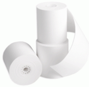
Cash roll / POS roll 80mm x 80mm Box of 60 rolls

Thermal Pos Receipt (Cash Register) Roll-55gsm,80mmX80mm,0.5" Inch Core,60 Rolls Each Box,1 Ply.