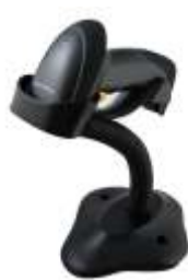
Pegasus PS3113 2D Reader Read all major 1D & 2D symbols RJ-45 phone jack connector handheld auto detection RS232, USB keyboard, USB virtual com