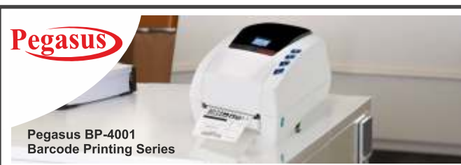
Pegasus BP-4001 Barcode Printing Series

Pegasus TPOS 10.1" Tablet POS System Intel cherry trail Z8300 quad core 1.44GHz Storage capacity : 32GB or 64GB selectable 7900 mA large capacitive battery Mega-Pixel camera ( 2 MP / 8 MP) Embedded finger print identification Wireless connectivity : WiFi 802.11