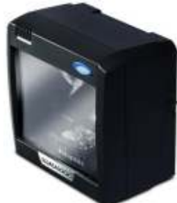
Datalogic Magellan 2200VS Reads UPC bar codes from 1 in./2.54 cm to over 30 in./76.2 cm Reliable performance, rated to 250,000+ insertions Bluetooth v2.1 Class 2 Radio Rechargeable replaceable battery with 'green sustainability'