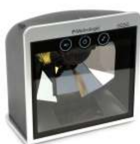
Honeywell MS-7820 Solaris Scan speed : 1,120 scans/sec Scan Pattern: 5 fields of 4 parallel lines Decode Capabilities Reads standard 1D and GS1 DataBar symbologies