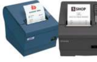
Epson TM-T88IV / TM-T88V Thermal Receipt Printer High Speed printing upto 7.9"/sec Same print speed for both text & graphics Easy-to-use drop in paper loading Wide range of connect-It interfaces