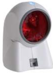
Honeywell MS-7120 Orbit Scan speed : 1,120 scans/sec Scan pattern: 5 fields of 4 parallel lines (omnidirectional) Number of scan line : 20 LaserPower: 0.681 mW (peak)