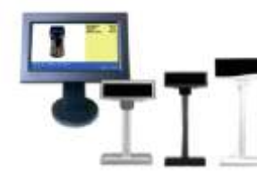
Pegasus H-701 & VFD Customer Display Large display 20x2 line support built-in 7 inches TFT panel Resolution: 480x243x3(RGB) able to access ECS/POS commands for text display support on the field VESA mounting (75x75mm)