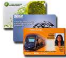
Custom Preprinted ID Cards Customized preprinted cards for loyalty Citizen, National ID, Patient, Membership & Bank cards, with the technology like RFID, NFC,MSR etc.