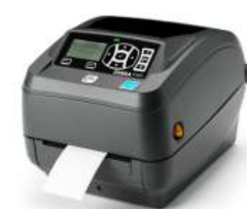
Zebra ZD500R Series Rfid Printer Print method: Direct Thermal print method Resolution: 203 dpi/8 dots per mm Optional: 300 dpi/12 dots per mm Memory: 128 MB Flash; 256 MB SDRAM Print Width: 4.09"/104mm