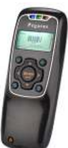
Pegasus IDC-3500 Data Collector With bluetooth communication Technology decode all major 1D Barcode symbologies including GS1 databar. High performance Scan rate 100 scans/sec