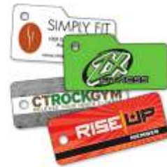
Key tags cards for loyalty and Membership Customized color Key-Tags cards for loyalties and membership systems.