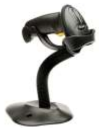
Zebra LS-2208 Handheld Barcode Scanner Scan Rate: 100 scans/sec Scanner Type: Bi-directional Laser Safety: CDRH Class II, IEC Class 2