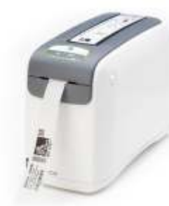
Zebra HC-100 Patient ID Solution Print Method: Direct thermal print Resolution: 300 dpi/12 dots per mm Print speed: 2"/51 mm per second Print width: 0.75"/19.05 mm, 1"/25.4 mm, 1.1875"/30.16 mm