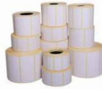
Barcode Labels Various sizes and materials like Direct Thermal, Thermal Transfer, polyester etc.