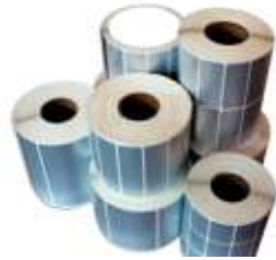
Assets Labels Available with the matt silver and white polyester with various sizes & custom sizes and color printing.