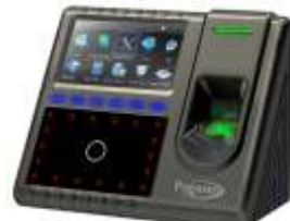
Pegasus iFace-U900 Time Attendance & Access Control Finger capacity : 2000 users Face capacity : 3000 users Display : 4.3 inch touch screen Communication: TCP/IP