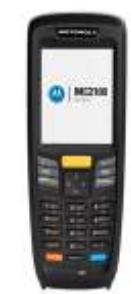
Motorola MC2100 Display : 2.8 in. QVGA with backlight TFT-LCD Connectivity : Wi-Fi 802.11b/g/n and Bluetooth (MC2180 only); USB 1.1 full speed host/client CPU: Marvell PXA 320 624 Mhz