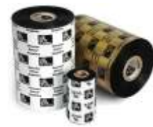
Zebra Genuine Supplies Wax and Resin Ribbons Available for Gc420, Zt410, Zt230 & other zebra printers.