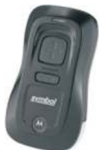
Motorola CS3000 Flexible mobile 1-D laser scanner 1D laser barcode scanner 512MB flash memory Includes USB cables Long battery : A 24-hour batch/12-hour