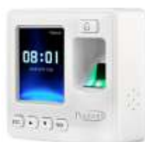
Pegasus iFC-SF100 Fingerprint Sensor : 500 DPI Optical Sensor Communication : USB-host ,TCP/ IP, RS 485 Fingerprint Templates : 500 Transaction Storage : 80,000 Card Capacity : 5000