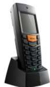
Pegasus DC-7010 Data Collector Pegasus DC-7010 is battery-operated portable data collector with look-up function. Data capacity 1 MB or 35,000 records scan trigger key, optical 1D reader