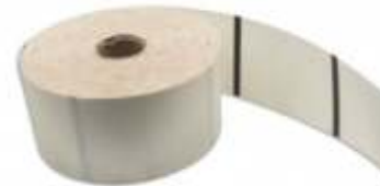
Queue System tickets Compatible for qmatic and other queue Systems.