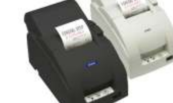
Epson TM-U220A/B Dot-matrix Impact printer Easy drop-in paper loading Two-color black and red printing Impactful logo printing in black Sturdily, lightweight printer.