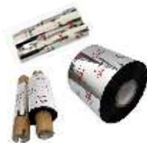
Pegasus Genuine Supplies Wax and Resin Ribbons Support all zebra, Honeywell and Citizen printers.