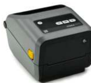
Zebra ZD420 Thermal Printer Print Method: Thermal transfer print Memory: 512 MB Flash 256 MB SDRAM Print Speed: 4 in./102 mm per second (300 dpi) Resolution: 203 dpi/8 dots per mm Print Width: 4.09 in./104 mm for 203 dpi and 300 dpi