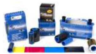
Zebra Genuine TrueColours Series Card Ribbon The wide range of Genuine Zebra Supplies includes both standard and custom-made media solutions for all applications.