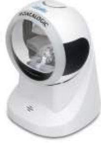
Datalogic Cobalto CO5300 Operating: 0 to 40 °C / 32 to 104 °F Storage/Transport: -40 to 70 °C / -40 to 158 °F Input Voltage: 5 VDC +/- 5% Light Source: 650 nm VLD Resolution: 0.130 mm / 5 mils