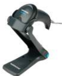
Datalogic QuickScan Lite QW2100 Read all major 1D symbols, as well as those on electronic screens image auto detection, Ready for all POS system easy firmware upgrade Drop Resistance to 1.5 m / 5.0 ft