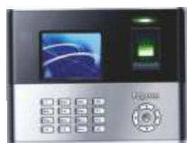
Pegasus iFC-3000 Time Attendance & Access Control Fingerprint capacity: 3000 users Time Attendance records: 100000 3.5" TFT LCD graphical display TCP/IP network interface support backup battery