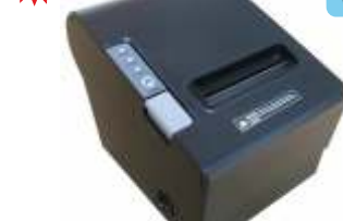
Pegasus PR-8001 Wifi Thermal Receipt Printer Print method: Thermal line Printing speed: 250mm/s Driver: Windows 2000/XP/7/Vista/8/Linux Paper type: Thermal paper (width 79.5±0.5mm, thickness 0.06 to 0.07mm) Port: Parallel, serial, USB, Ethernet interfaces optional