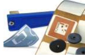
RFID Labels & Tags RFID wide range of labels/tags for jewelry, Apparels laundries, warehouse and assets.