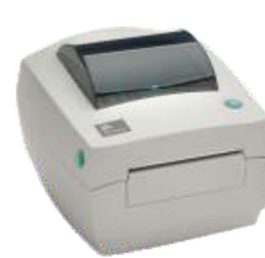
Zebra GC420 Series Desktop Printer Print methods: Direct thermal print method and thermal 32 bit RISC processor Resolution: 203 dpi/8 dots per mm 4"/102 mm per second maximum Print width: 4.09"/104 mm