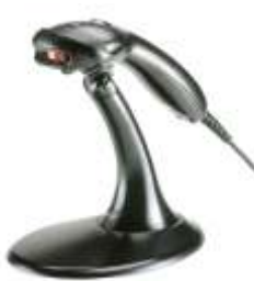
Honeywell MS-9520 650-nm Nanometer laser Codegate CodeGate® data transmissions Scan speed: 72_2 scan line/sec Minimum bar width: 0.127mm(5mil)