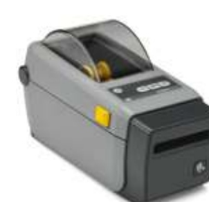
Zebra ZD410 Series Desktop Printer Print method: Direct Thermal print method Resolution: 203 dpi/8 dots per mm Optional: 300 dpi/12 dots per mm Memory: 512 MB Flash; 256 MB SDRAM Print Width: 2.2 in./56 mm for 203 dpi and 300 dpi