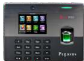
Pegasus iFC-3100 Time Attendance & Access Control Fingerprint capacity: 20,000 users Time Attendance records: 150,000 ID Card Capacity: 20,000 (Optional) Display: 3.5" TFT LCD